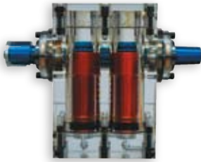
Patented Thinline® Rack and Pinion Rotary Actuator