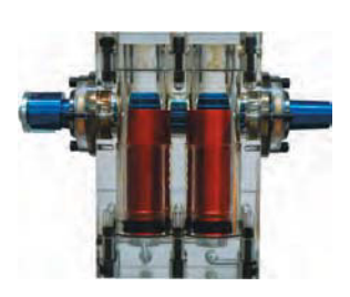
Patented Bayne Thinline Rack-and-Pinion Rotary Actuator