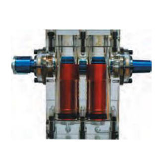
Patented Bayne Thinline Rack-and-Pinion Rotary Actuator

The patented Bayne Thinline design incorporates a sweeping action that automatically adjusts for uneven terrain, preventing operators from having to manually hoist carts onto the lift plate. The MBTL-180 was specifically designed to offer the most ground clearance possible for rear-load garbage truck applications.